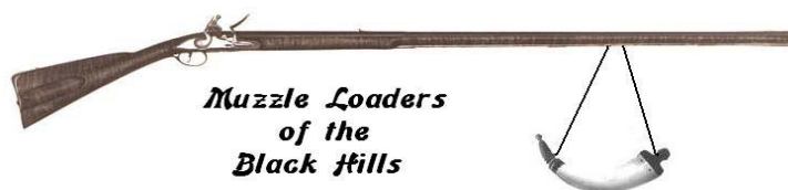
Muzzle Loaders of the Black Hills

Labor Day Weekend - September 3, 4, 5, 6 & 7, 2009